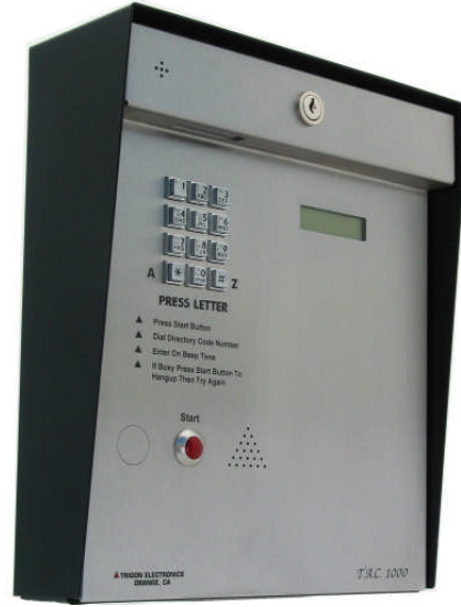
Optional Prox Reader mounts easily to face